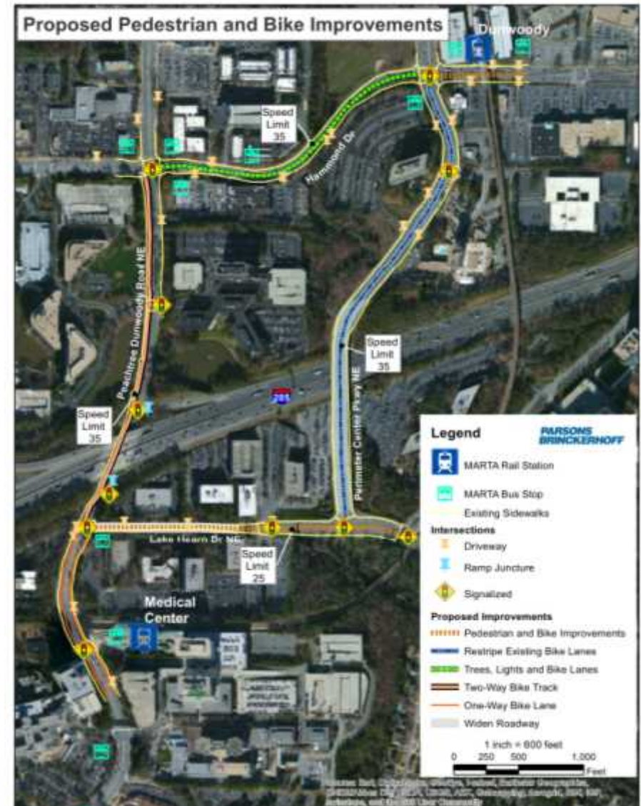
Intersection Improvement of Lake Hearn Drive at Peachtree Dunwoody Road